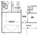
Upper Level 1,365 Sq. Ft.